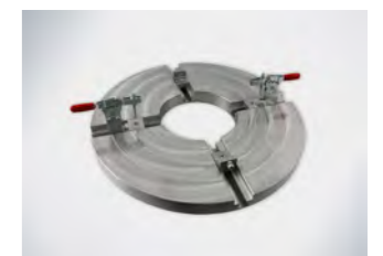
Welding neck support