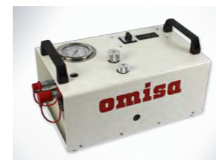
All connections at the back panel of the hydraulic unit