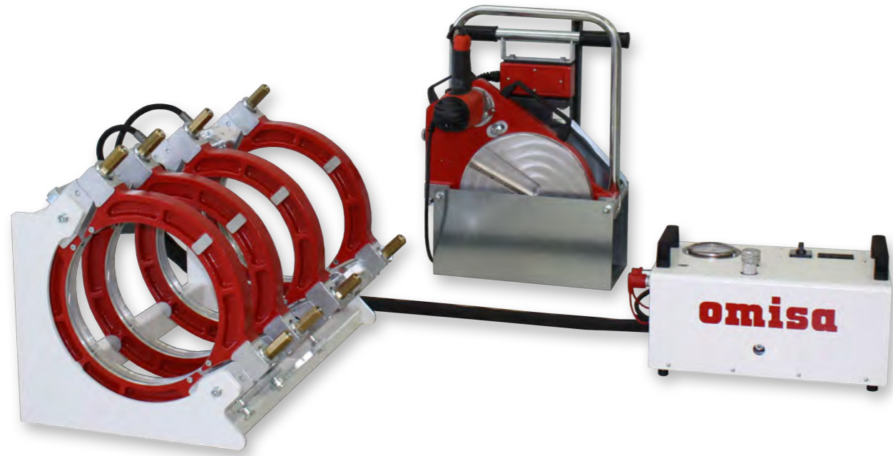
Stand-alone in Butt-Welding