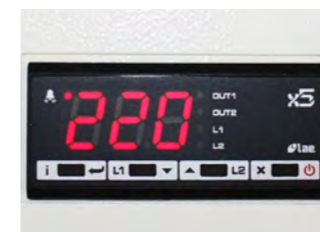
Centralized temperature control

All components are covered by the OMISA warranty.